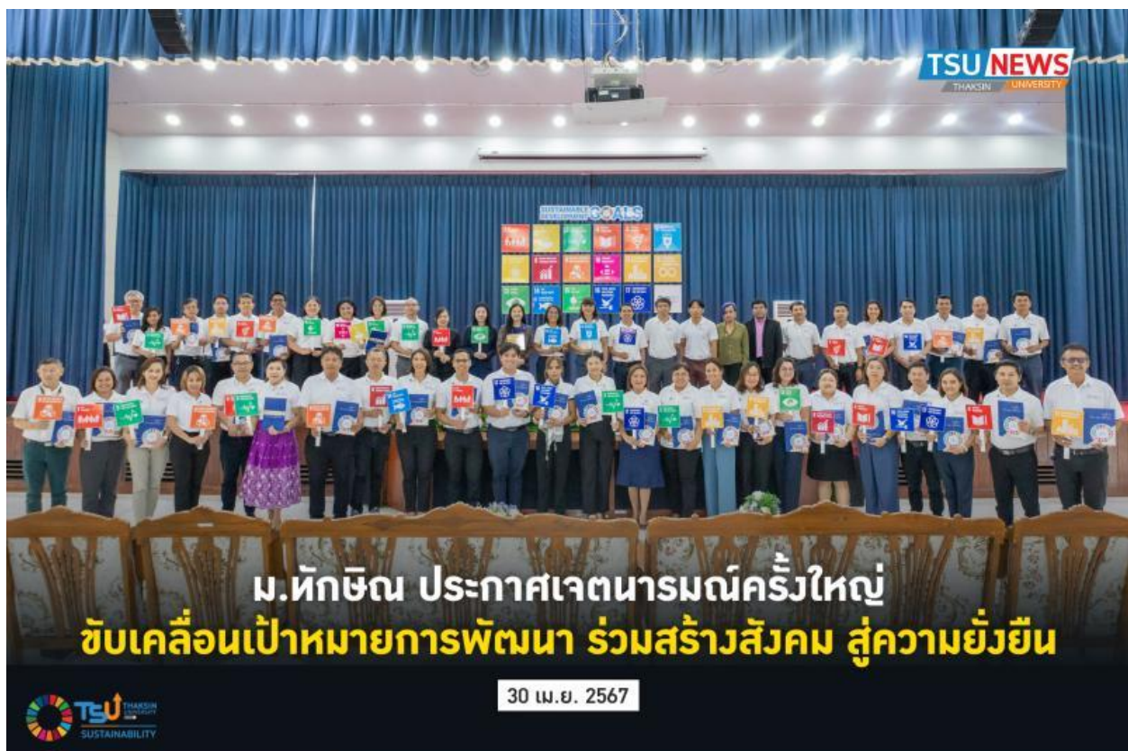
Figure 2: Official Declaration of Sustainably Driving SDGs with Society

The official declaration made 30 th April 2024 marks the university's commitment to implementing its plans in accordance with the SDGs, ensuring progress across various contexts and dimensions. The SDGs can be applied to multiple areas of the university's work, including research, academic programs, internal administration, and collaboration with external organizations. The SDGs will serve as a guiding framework that helps shape future directions and ensures the university's continued efforts toward sustainability.